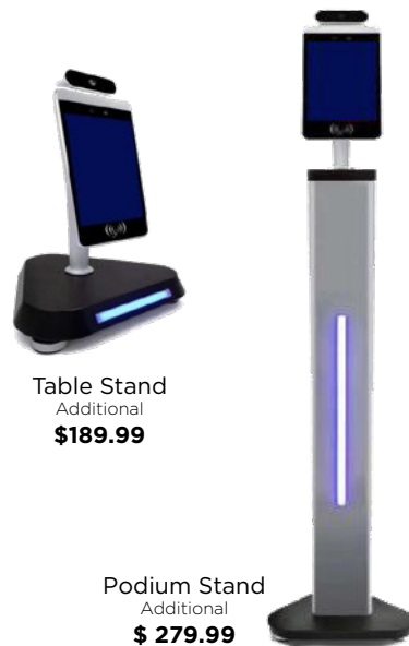
Table Stand Additional $189.99