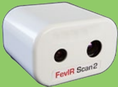
Skin Temperature Measurement System

As new protocol is developed for the changing work environment, temperature checks will be an important implementation for entering buildings. Check out our options below to get started!