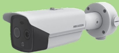
Thermographic Bullet Camera