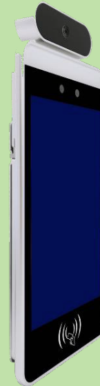
Temperature Scan & Facial Recognition Solutions