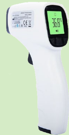
Digital Forehead Thermometer